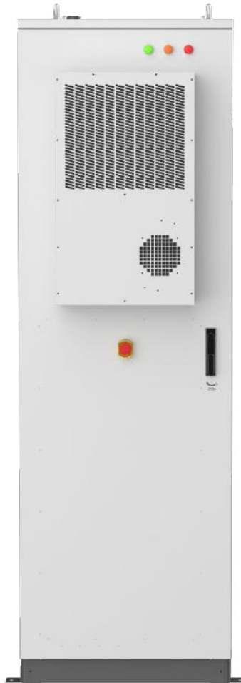
111kWh DC Battery Cabinet