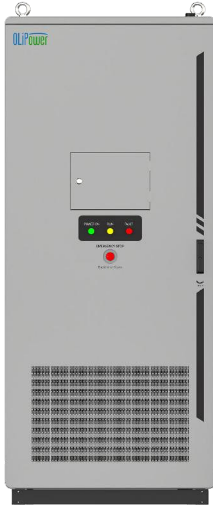
261kWh DC Battery Cabinet